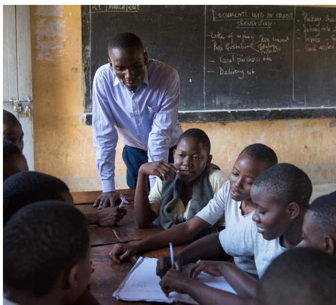
Educate!

Organisation for Economic Co-operation and Development (OECD). "The Future We Want: The Future of Education and Skills—Education 2030." Paris: Organisation for Economic Co-operation and Development, 2018.