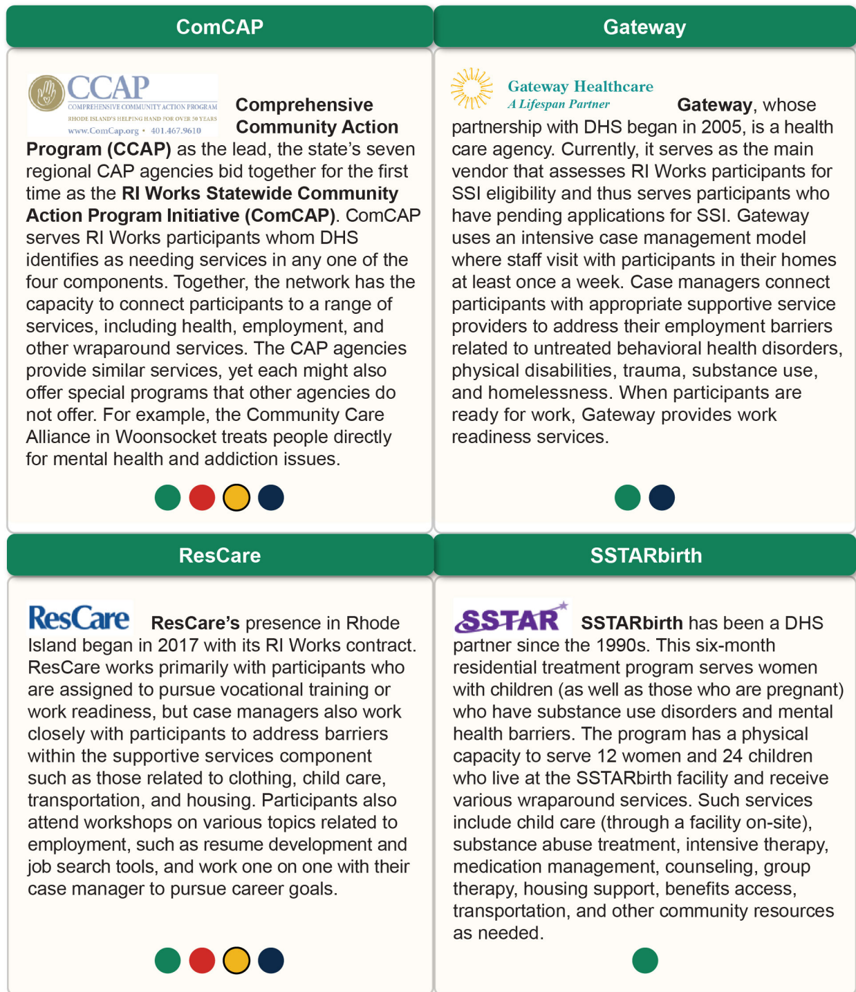
Figure 2. RI Works vendors that provide supportive services

Notes: Colored circles denote the components in which each vendor can provide services to RI Works participants: ● supportive services; ● teen and family services; ● vocational training; ● work readiness.