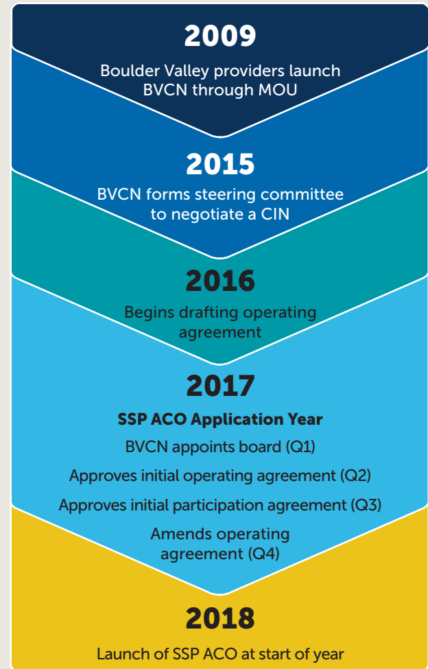
Figure 1 Timeline for Forming BVCN ACO

engagement in the ACO’s work. The remainder of this case study describes not only the governance structure and its use in clinician engagement in more detail but also its success to date.