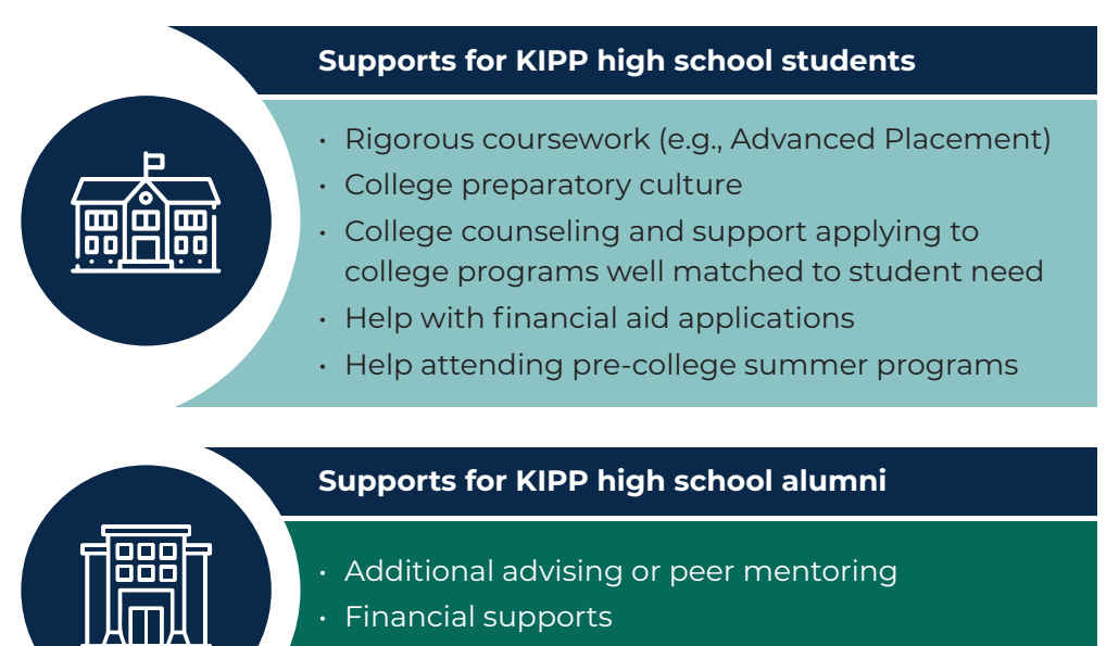
Figure 3. What drives KIPP high school success in promoting strong college outcomes?

college preparatory culture at KIPP high schools, as well as college-related supports delivered to the schools' students and alumni (Figure 3). However, it remains to be seen whether KIPP's impacts on college enrollment and graduation will ultimately translate into improved employment and earnings outcomes for these KIPP alumni.