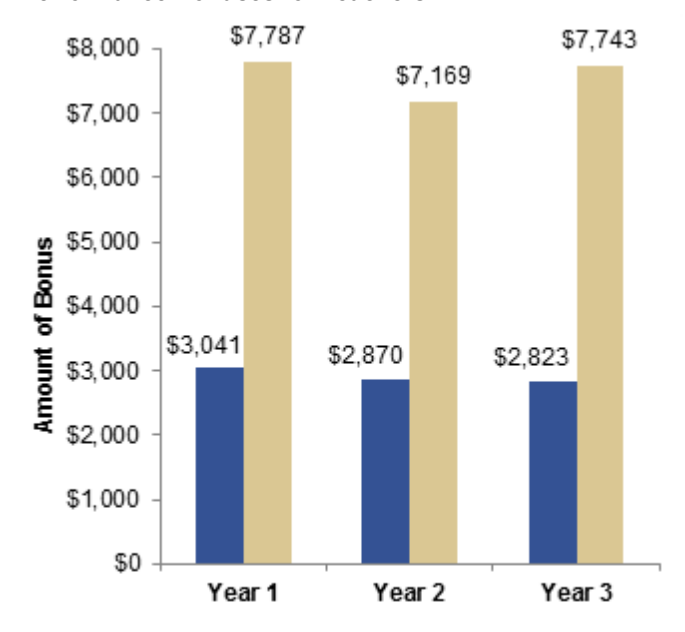
Figure 4. Reported and Actual Maximum Pay-for-Performance Bonuses for Teachers

■Reported by Teachers ■Actual Awarded by Districts