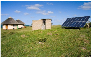
School solar system

The $11 million Kigoma solar activity was one component of a $199.5 million energy sector project in Tanzania funded by the Millennium Challenge Corporation (MCC). The solar activity was designed to provide photovoltaic (PV) systems in the Kigoma region of Tanzania to schools, health centers, markets, businesses, fishermen, and households. Mathematica's performance evaluation found that two years after the activity, use of solar PV systems increased both among those targeted to participate in the program and those who were not targeted, which may reflect a growing interest in solar energy in the region. Recipients of the PV systems were using their systems regularly but reported some issues with the systems' capacity and performance. Liquid fuel use was lower among those targeted for the systems than among those not targeted, suggesting that solar PV systems may serve some of the same energy needs as liquid fuels, such as providing light and powering appliances. There was limited evidence of an association between the Kigoma solar activity and other key outcomes such as investments, economic activity, or human capital accumulation.