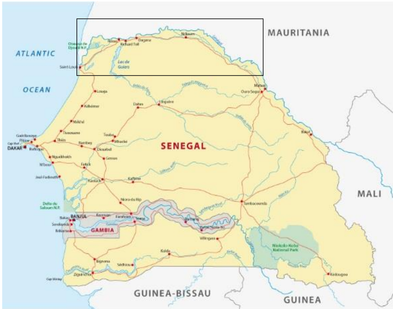
Figure C.1. Map of Senegal

The IWRM Project took place in the Senegal River Valley (SRV) in Northern Senegal. Figure C.1 details a map of Senegal that highlights the location of the SRV. This evaluation occurred in two areas of the SRV: the Delta and Podor regions. Figure C.2 shows the treatment areas in orange and the comparison areas in dark green for the Delta region. The map, produced by SAED, also details other geographical features of interest, including communautés rurales , villages, and water sources. We do not have a map for Podor that accurately reflects how land was allocated to beneficiaries.