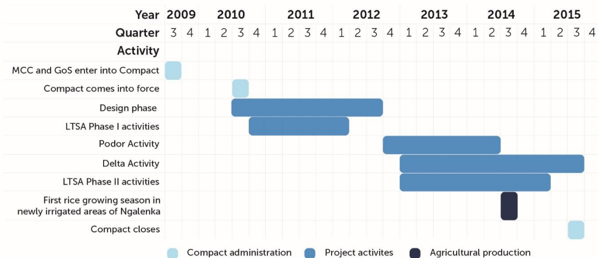
Figure II.1. Timeline of IWRM Project activities

MCC identified at least 1,200 individuals who were economically and/or physically displaced as a result of the project. Over the course of over a dozen meetings with project-affected people (PAPs), and input from project participants, MCC learned that in addition to physical relocation due to infrastructure work, individuals also lost income due to improper training and farming techniques for irrigated rice cultivation in Ngalenka, and may have been affected by issues with the infrastructure such as slow release of water from dispersion basins,