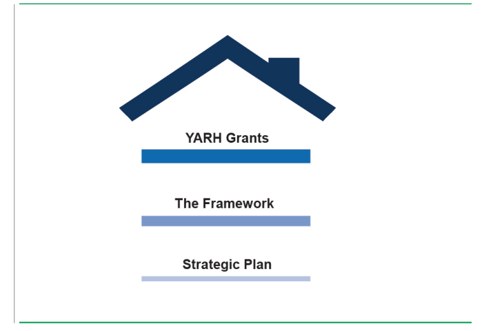
Figure 1. Relationship between YARH grants and the Framework

Whereas the Framework targets the broader population of youth at risk of homelessness, the YARH multiphase grant program focuses on a subset of this population—youth currently or previously involved with the child welfare system. The Children's Bureau (CB) developed the grant program to support the design of comprehensive service models to prevent homelessness among (1) adolescents who enter foster care between 14 and 17; (2) young adults aging out of foster care, and (3) homeless youth/young adults with foster care histories up to 21 (Figure 2). CB directed grantees to