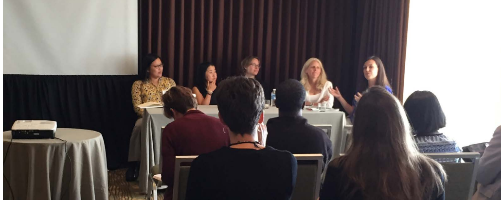
Roundtable discussion at the NAWRS Annual Workshop in Atlanta, Georgia, August 2015.

use of opportunistic experiments—randomized controlled trials that study the effects of an initiative, program change, or policy action that an agency or program plans or intends to implement, as opposed to one designed specifically for a research study.