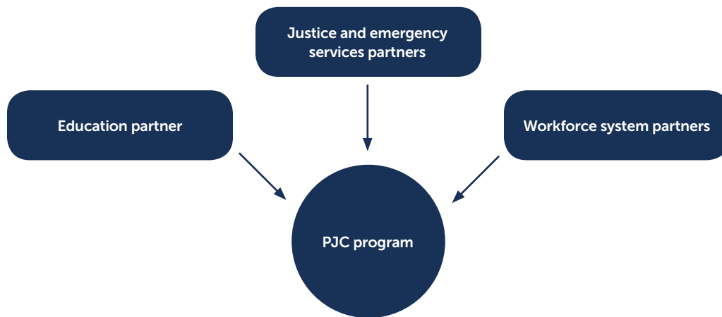
Exhibit 3. Types of PJC partners

Partner organizations are critical to PJC program operations. Grantees initially identified several partners in their applications, but these partners often changed as they set up their programs. Each program relies on multiple partners, which fall into three broad categories (Exhibit 3).