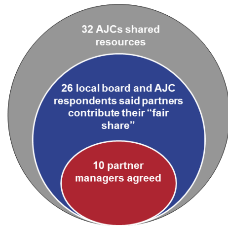
Figure 2. Perceptions of fairness among resource sharing AJCs