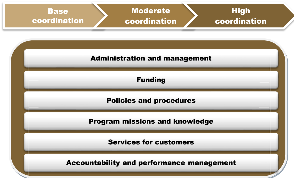
Figure ES.1 Coordination Continuum and Components for the Study of TANF/WIA Coordination