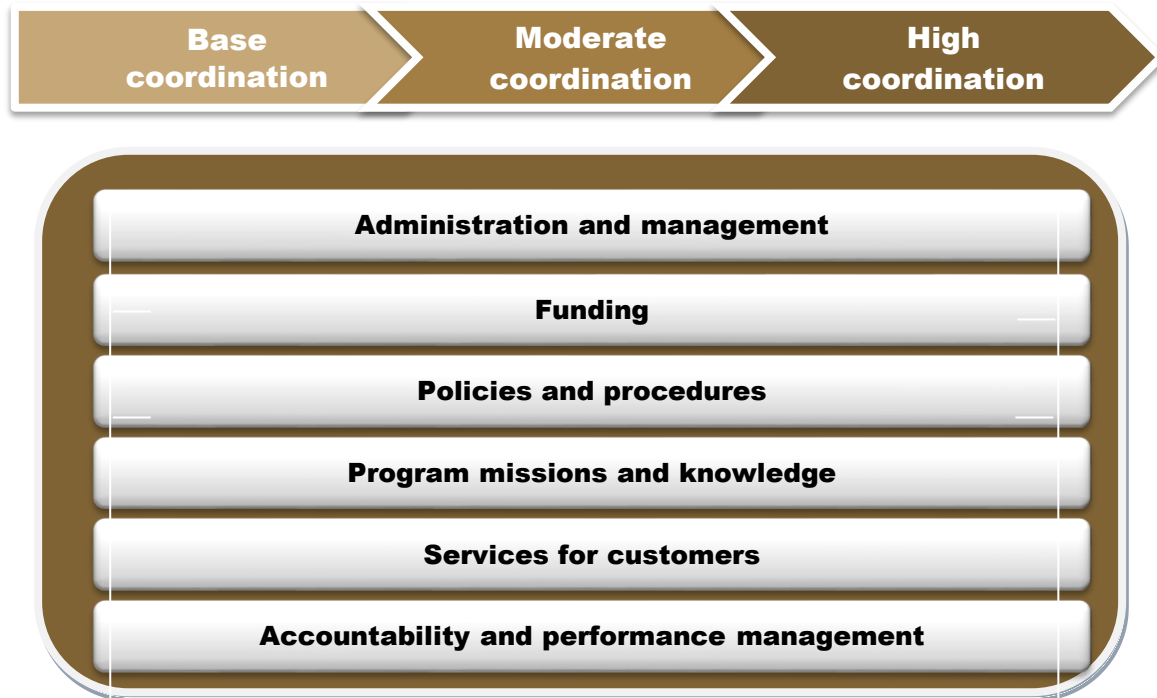
Figure I.1. Coordination Continuum and Components for the Study of TANF/WIA Coordination

The result is a range of strategies (described in Chapter IV) presented along a coordination continuum and for each of the six components. Presenting the strategies along a continuum makes the broad concept of “coordination” accessible in digestible pieces and provides an opportunity for other states and localities to adopt strategies appropriate to their context.