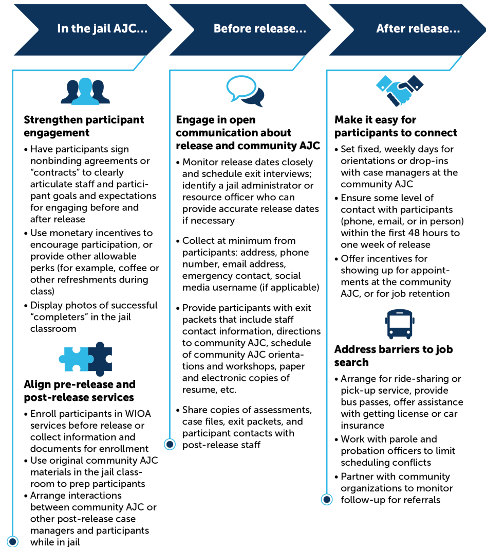
Figure 3. Examples of strategies used inside and outside the jail to encourage post-release participation