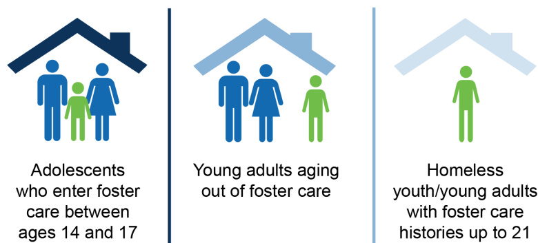
Figure 1. YARH target populations

This brief discusses how 7 of the 12 Phase I grantees who were not awarded Phase II grants are working to sustain efforts in their community to prevent homelessness based on the planning accomplished during Phase I. Sustainability efforts were discussed in individual phone calls with the Phase I project director and/or project manager in November and December 2015, as most Phase I grantees were preparing to submit their final Phase I grant report.