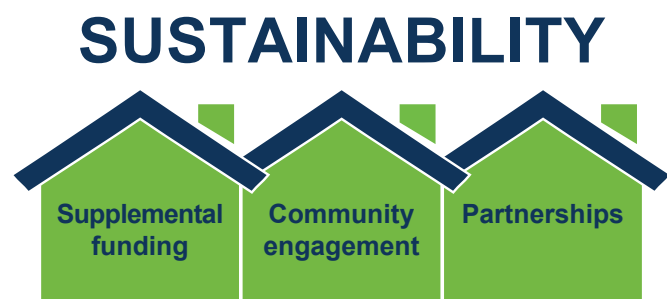
Figure 4. Facilitating factors impacting sustainability

living services for transition-age and homeless youth. One grantee received funding from a foundation to bring in a particular independent living services provider. A second grantee intended to leverage state funding to modify existing services. At the time of the interviews, the other five of the interviewed non-awardees had yet to receive additional funding after Phase I or were actively searching for funding by, for example, monitoring upcoming funding opportunities from child welfare agencies.